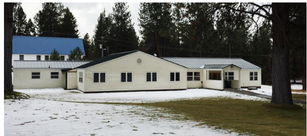
CRFPD Administration Building

Our Main Station is located in the heart of Crescent and houses a Structure Engine, an Urban Interface Engine, and two ALS ambulances. Hackett Station is located approx. 9 miles north of Gilchrist and houses a Type 6 Wildland Engine, a Water Tender, and a Structure Engine.