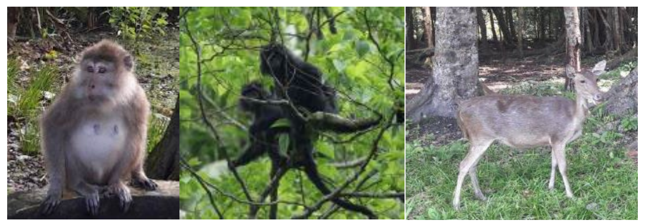
During the program, students, staff and professionals from IPB and affiliated institutions also will participate in the program courses and/or conduct independent research projects at the reserve. This joint participation offers a unique opportunity for cultural exchange and awareness and enables further development of foreign language competency among the participants from both countries.

Native fauna includes Longtailed macaque monkeys ( Macaca fascicularis ), Javan Langurs or Ebony Leaf Monkeys ( Trachypithecus auratus ), Red Deer ( Cervus timorensis ) (pictured respectively, below), and a number of other mammal, bird and reptile species. In addition, there are a wide variety of insects and crustacea. This nature reserve offers an excellent setting in which to gain field study experience and conduct field research.