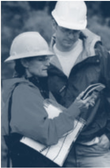
Field experience brings together the understanding of math and science skills and concepts.