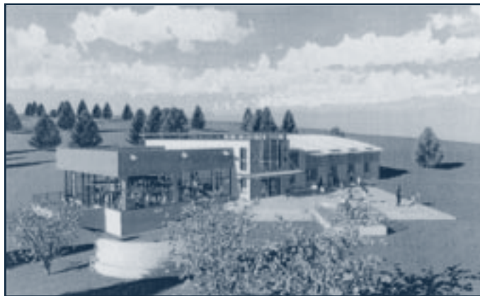
The proposed Madras Campus will serve students and the work force in the northern part of the COCC District, a top priority of the COCC Board of Directors.