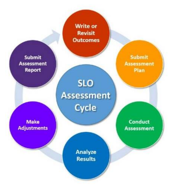
Figure 1: Assessment Cycle at COCC

In addition to the general education outcomes work described earlier, COCC has in recent years put an increased focus on supporting the development of concise and measurable outcomes at all levels. The director of assessment and curriculum created a <u>Faculty Tool Kit</u> for instructional assessment, which includes guidance on developing learning outcomes as well as before-and-after examples of outcome improvements. A more recently added resource is a Canvas course called SLO 101: Student Learning Outcomes Orientation . This is a self-paced course available to all faculty that teaches its users about the rationale and purpose of outcomes assessment, COCC's assessment cycle, how to evaluate existing outcomes and create improved ones, and also contains guidance about assessment. The director of assessment and curriculum has also held individual consultations and group workshops with faculty who are working on revising their outcomes.