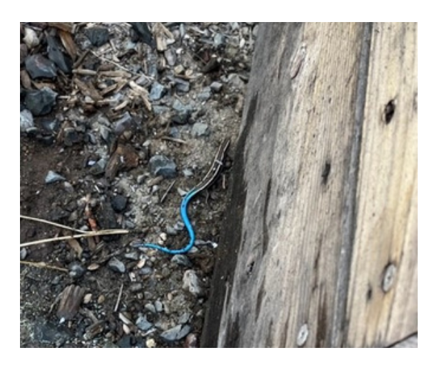
A blue-tailed lizard in the garden