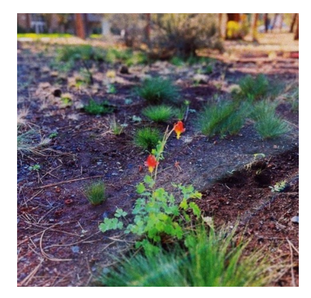
Columbine at the pollinator path

In the past few years, the number of SUS courses have grown from one to five, and SD courses have grown from three to eleven. We hope to continue to expand sustainability curricula at COCC to meet student, workforce, and planetary demands. Importantly, many of these courses articulate directly to regional colleges with sustainability-related degrees. The most recent SUS/SD course list is available at the COCC Sustainability Committee website.