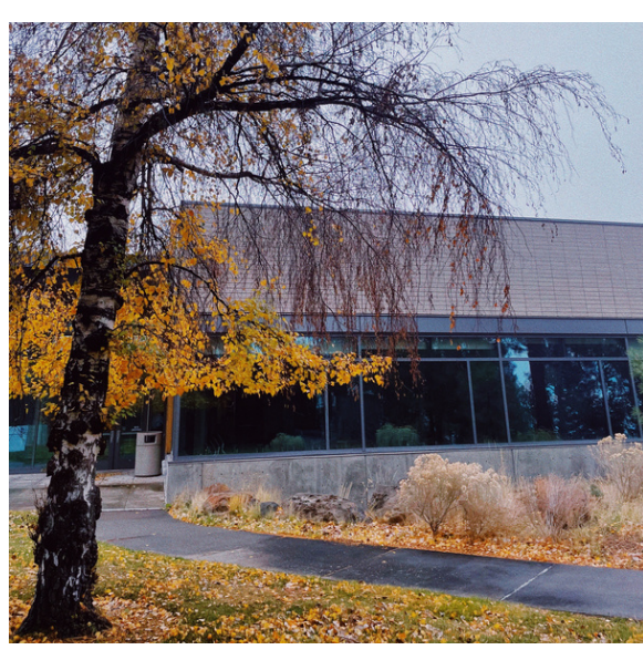
Middleton Science Center, rainy day