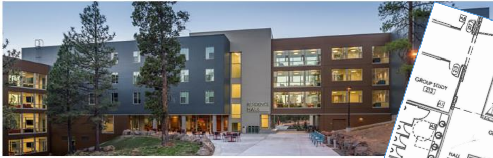
Completed Residence Hall.