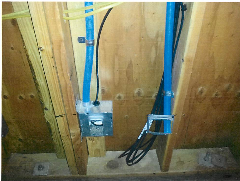
Data Backbox & Coax Television Cable – Typical Room