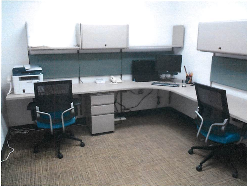
Printer & Computer Install – Faculty Office Space