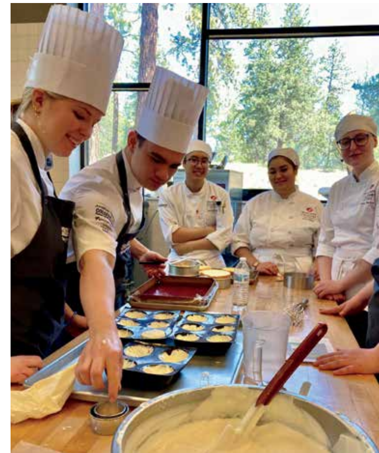
Culinary and hospitality students from College 360 in Silkeborg, Denmark, visit COCC.