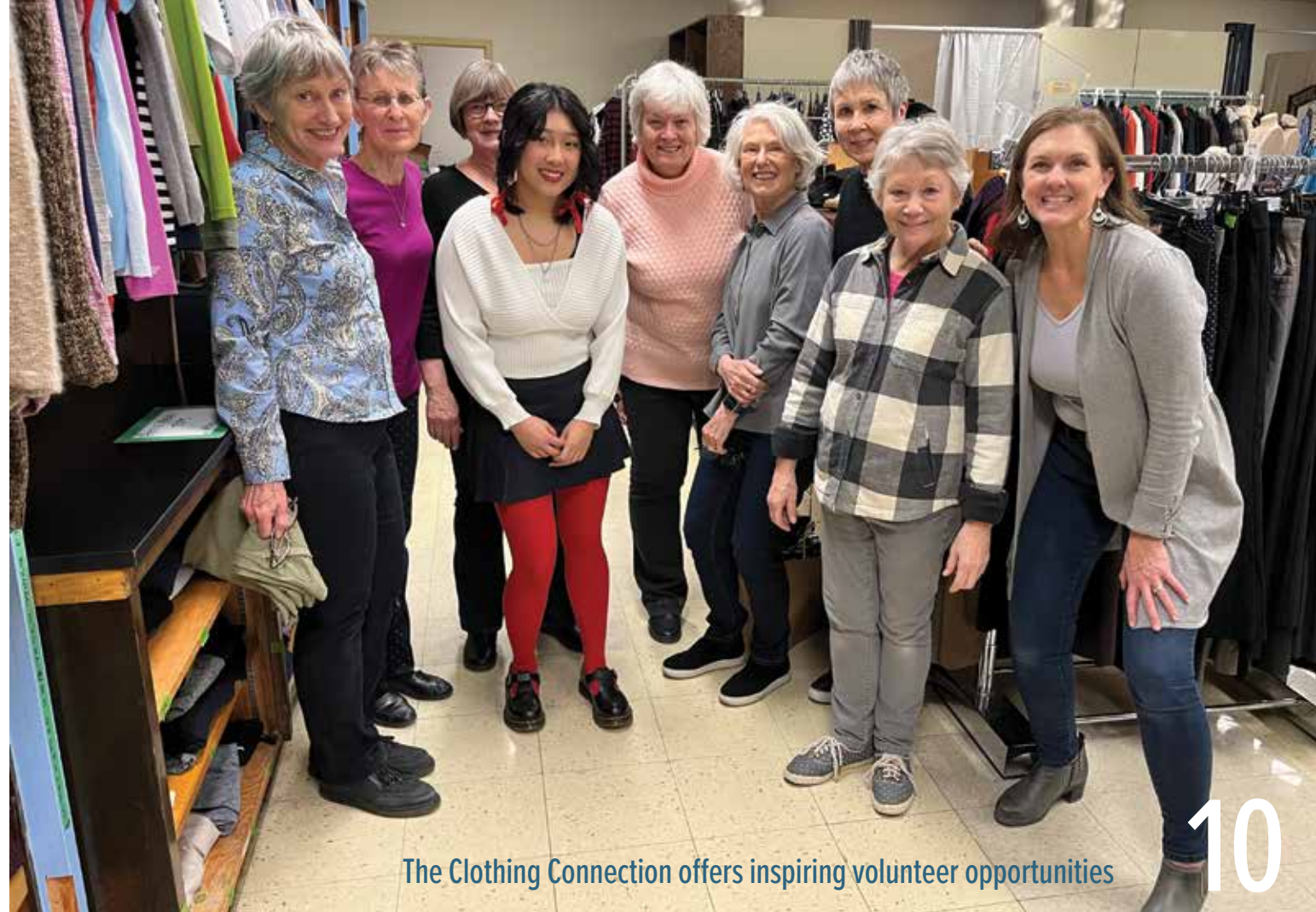
The Clothing Connection offers inspiring volunteer opportunities

Your gifts in 2022-23 have greatly improved students' access to education